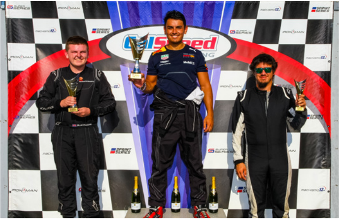
A Main Podium