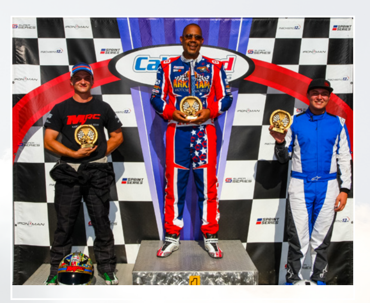
A Main Podium