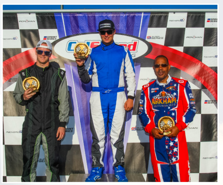
A Main Podium

Round 7's qualifying would see the change in track configuration to Classico CCW and different names at the top for the entire duration of the session. A whole gamut of