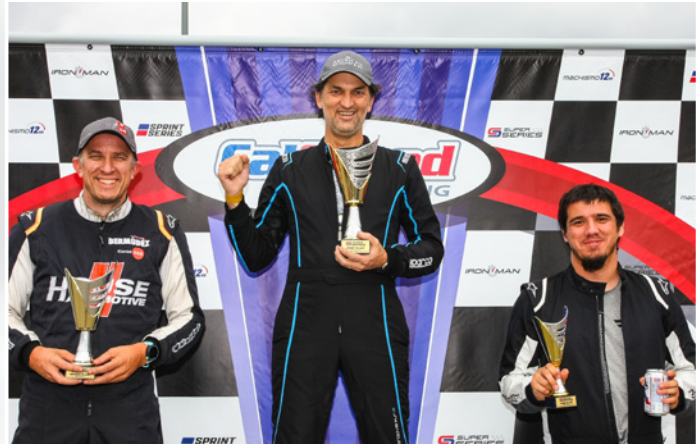
A Main Podium