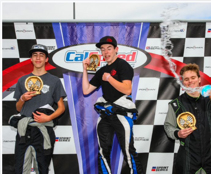
A Main Podium