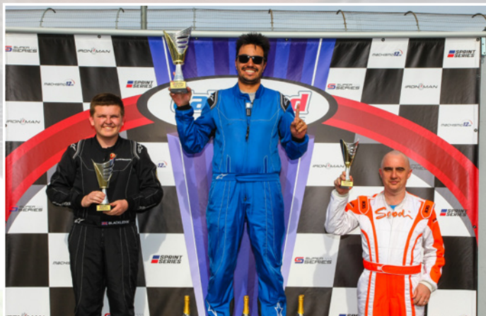
A Main Podium