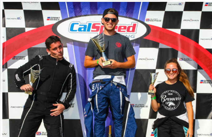
A Main Podium