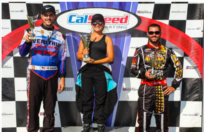
A Main Podium