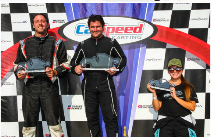
A Main Podium