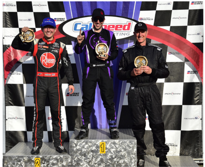
A Main Podium