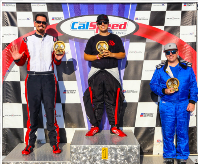
A Main Podium