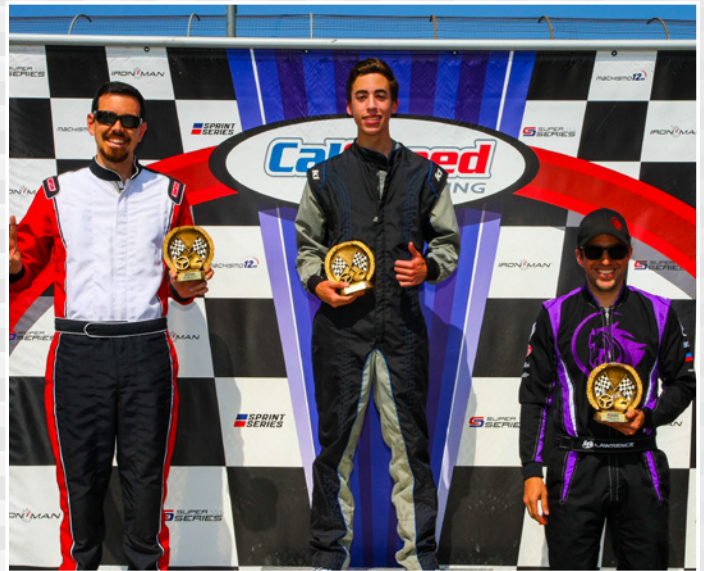
A Main Podium