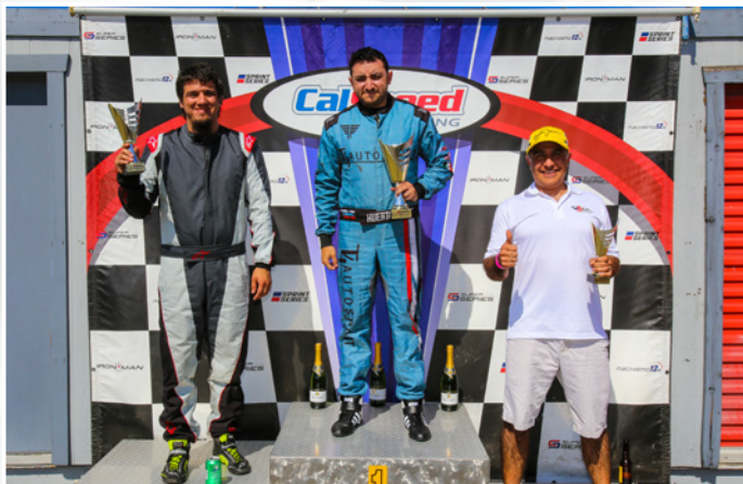
A Main Podium