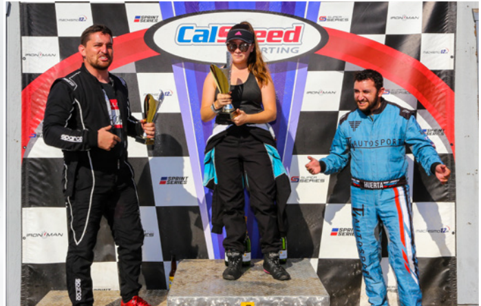
A Main Podium