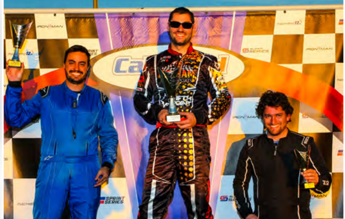
A Main Podium