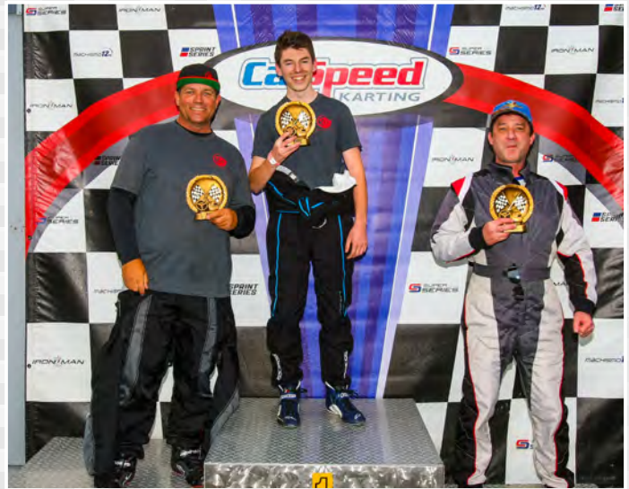
A Main Podium