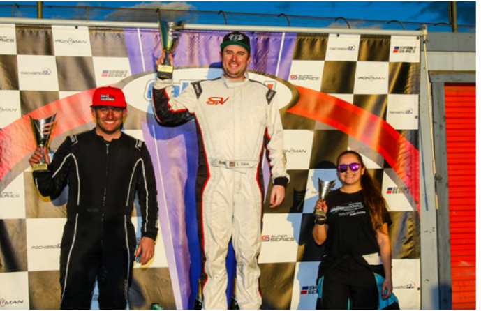
A Main Podium