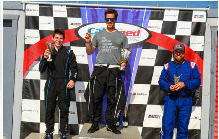
A Main Podium