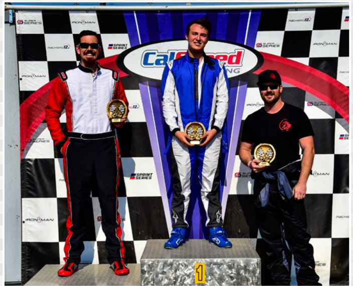
A Main Podium