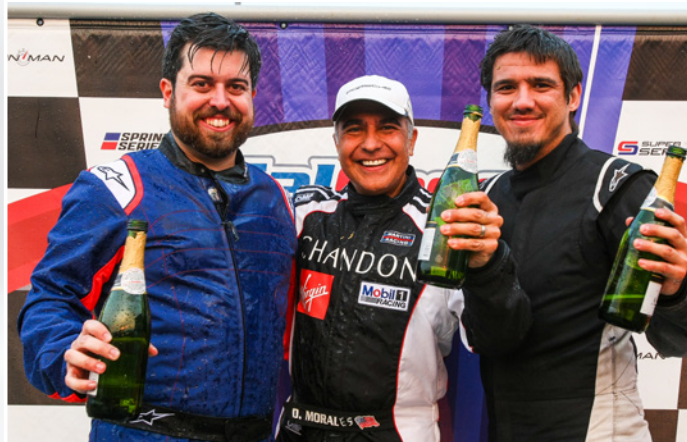
A Main Podium